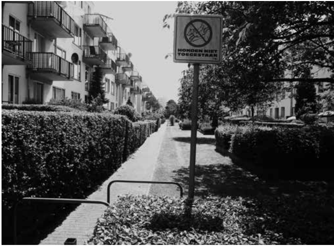
KLEINPOLDER, ROTTERDAM WITH 'RESIDENTIAL PATH'

KLEINPOLDER, ROTTERDAM, S, REZIDENČNOU CESTOU'