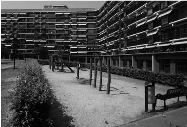
FLATS IN OMMOORD, ROTTERDAM

Photo Foto: Hofmeester-Aero Camera, 1953