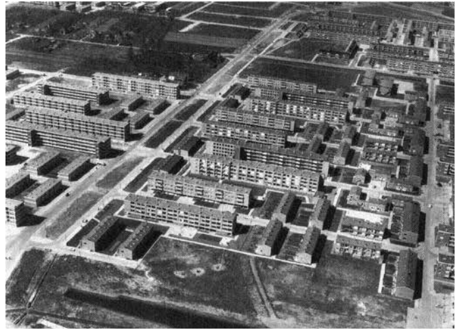
AERIAL PHOTOGRAPH, PENDRECHT, ROTTERDAM

LETECKÝ POHLAD NA ŠTVRŤ PENDRECHT, ROTTERDAM