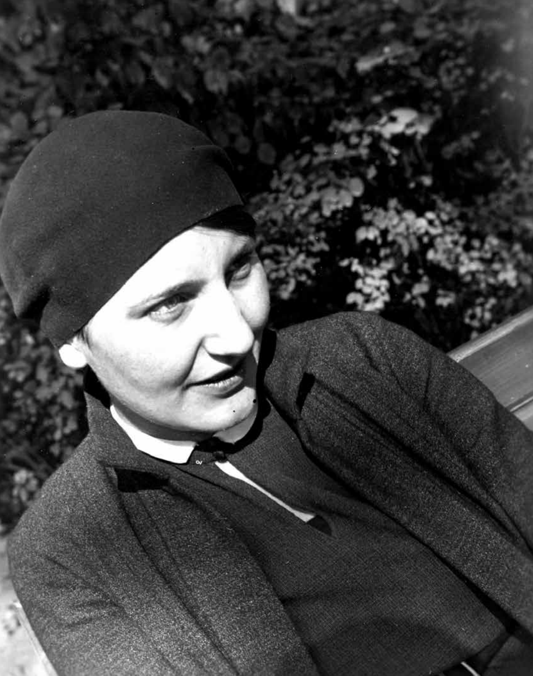
LOTTE BEESE, 1930